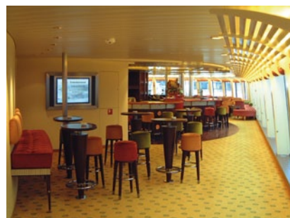
16:9 TFT screen