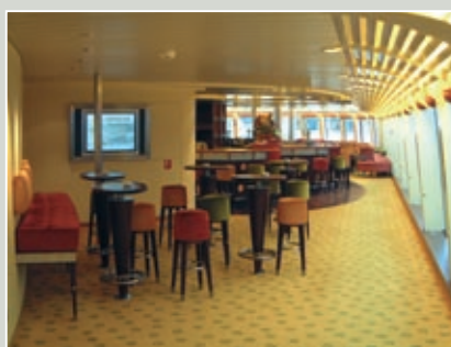
16:9 TFT screen